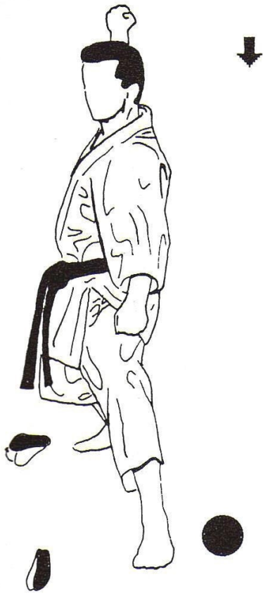
32 - Ko Kutsu Dachi gauche Gedan Barai gauche Ushiro Uchi Uke droit