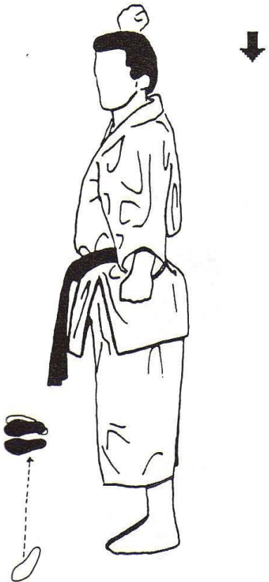
33 - Ramener le pied gauche Heisoku Dachi